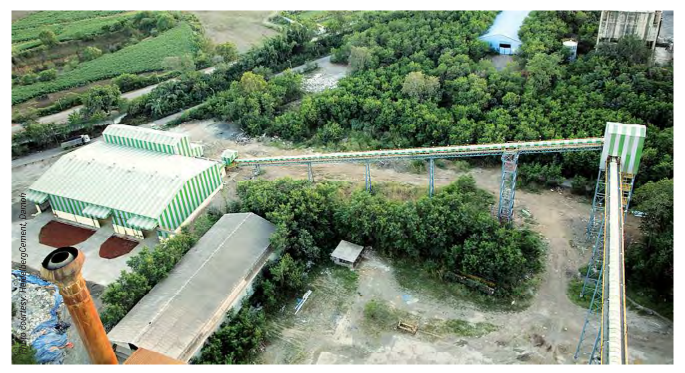
Sourcing of alternative fuels is one of the major activities at the company's cement plant.