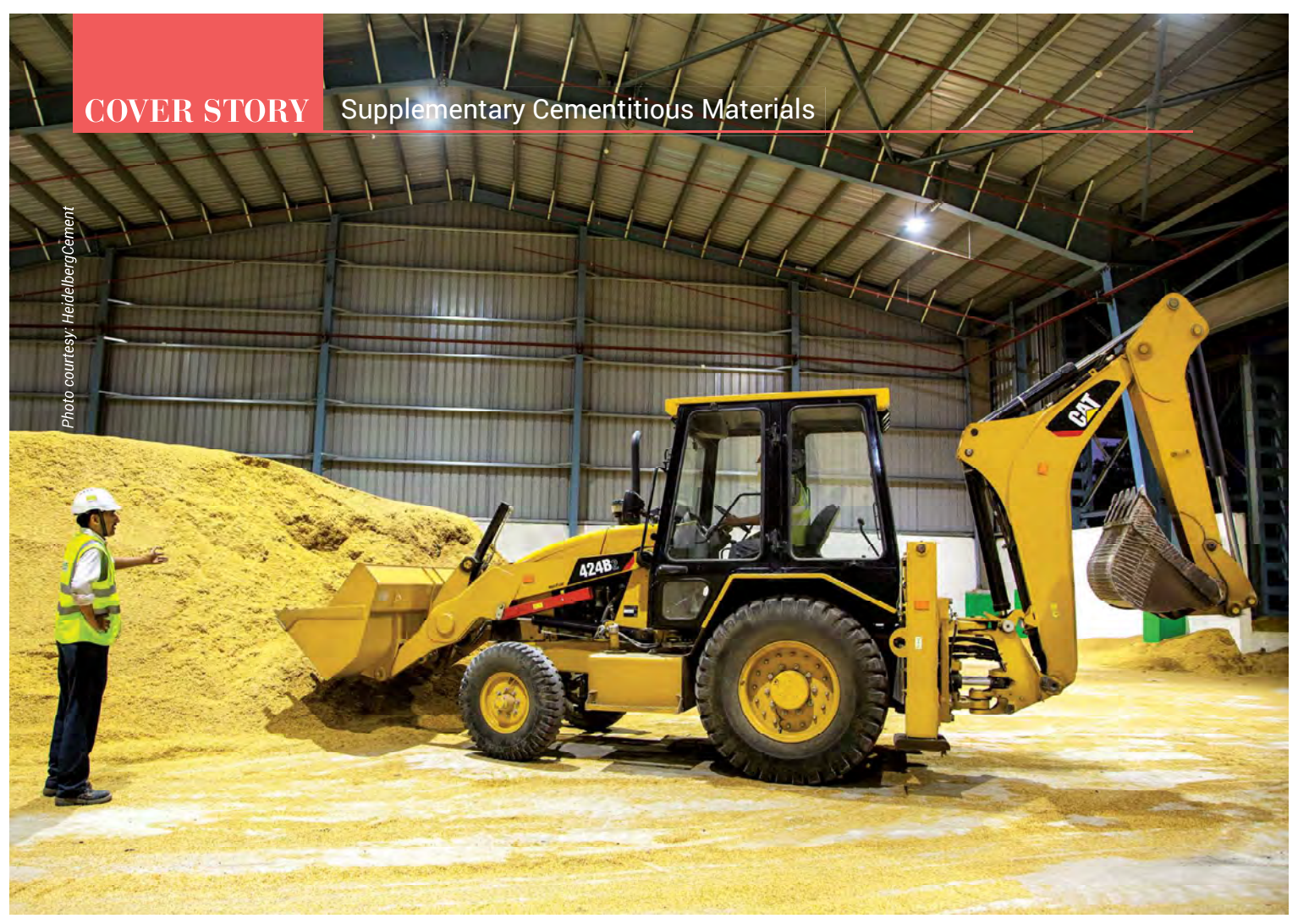
Alternative fuel storage units emphasise the potential they hold in making the cement sector cleaner and greener.

These materials have already been decarbonated and could be used as an alternative to 'virgin' limestone thus avoiding CO<sub>2</sub> emissions during its transformation to lime in the production process.